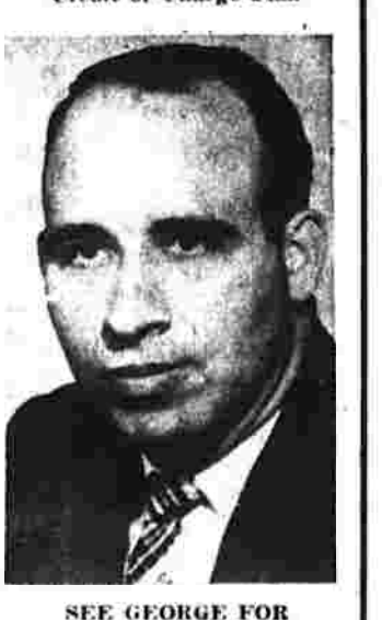
SEE GEORGE FOR THIS WEEK'S SPECIAL

OPEN FROM 9 TILL 9 P.M. FOR YOUR CONVENIENCE